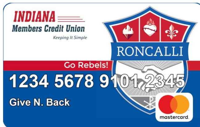
*Pictured is the Indiana Members Credit Union, Roncalli Rebels debit card.