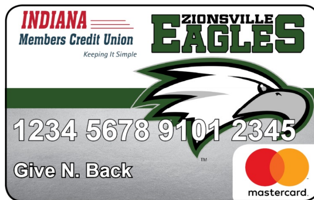
*Pictured is the Indiana Members Credit Union, Zionsville Eagles debit card.