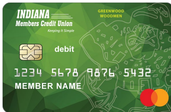
*Pictured is the Indiana Members Credit Union, Greenwood Woodmen debit card.