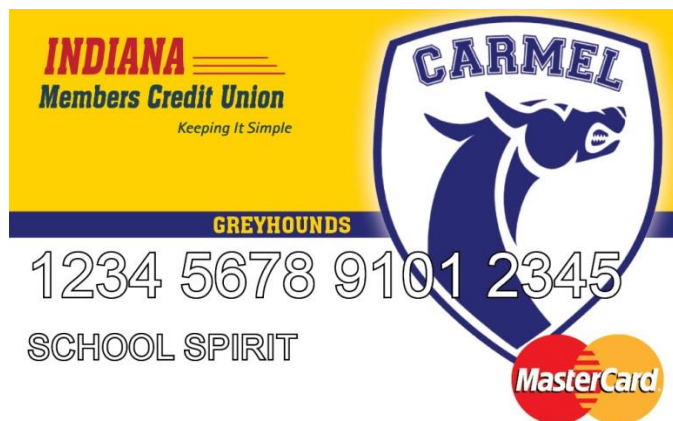
*Pictured is the Indiana Members Credit Union, Carmel Greyhounds debit card.